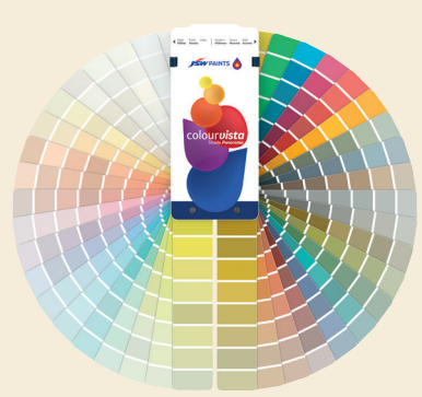
Colourvista Shade Panorama

JSW Paints presents Colourvista Shade Panorama, a splendid collection of 1808 curated shades assembled in tones for every mood. The Colourvista Shade Panorama Fandeck is uniquely designed to easily pick the right colour and choose colour combinations for homes.