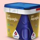
AQUAGLO MAJESTIC GOLD