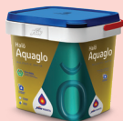
AQUAGLO MAJESTIC SATIN