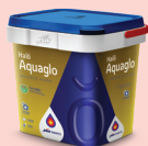
AQUAGLO MAJESTIC GLOSS

Every JSW Paints product works to transform beautiful thoughts into reality. Everything about the paint, its application and finish is designed to be the 'Simple-Swift-Sure' way to making homes beautiful.