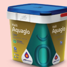
AQUAGLO MAJESTIC CLEAR