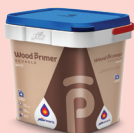
AQUAGLO WOOD PRIMER