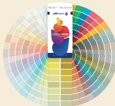
Colourv ista Shade Panorama

JSW Paints presents Colourv ista Shade Panorama, a splendid collection of 1808 curated shades assembled in tones for every mood. The Colourv ista Shade Panorama Fandeck is uniquely designed to easily pick the right colour and choose colour combinations for homes.