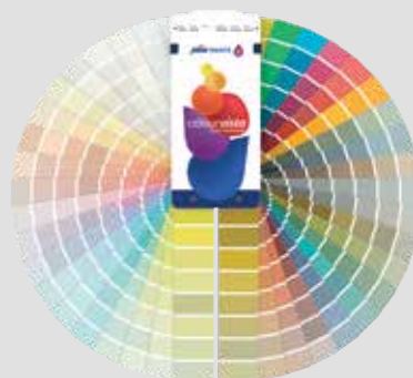
Colourv ista Shade Panorama

JSW Paints presents Colourv ista Shade Panorama , a splendid collection of 1808 curated shades assembled in tones for every mood. The Colourv ista Shade Panorama Fandeck is uniquely designed to easily pick the right colour and choose colour combinations for homes.