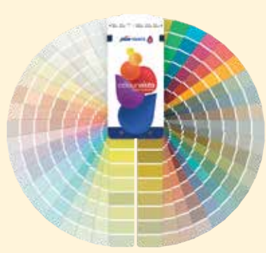
Colour vista Shade Panorama

JSW Paints presents Colourvista, a splendid collection of 1808 curated shades assembled in tones for every mood. The Colourvista Panorama Fandeck is uniquely designed to easily pick the right colour and choose colour combinations for homes.