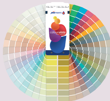
Colourista Shade Panorama

JSW Paints presents Colourista Shade Panorama, a splendid collection of 1808 curated shades assembled in tones for every mood. The Colourista Shade Panorama Fandeck is uniquely designed to easily pick the right colour and choose colour combinations for homes.