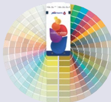
Colourv ista Shade Panorama

JSW Paints presents Colourv ista Shade Panorama , a splendid collection of 1808 curated shades assembled in tones for every mood. The Colourv ista Shade Panorama Fandeck is uniquely designed to easily pick the right colour and choose colour combinations for homes.